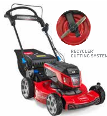
RECYCLER® CUTTING SYSTEM