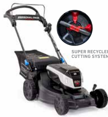
SUPER RECYCLER® CUTTING SYSTEM