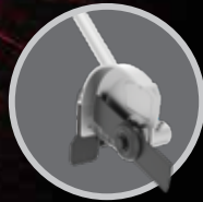
STICK EDGER 88710