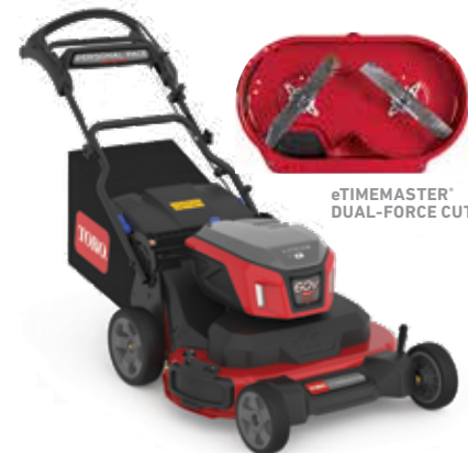
eTIMEMASTER® DUAL-FORCE CUTTING SYSTEM