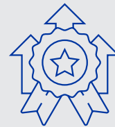
CONSISTENTLY EXCEEDS INDUSTRY STANDARDS