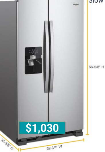
WRS321SDHZ 36" wide, 25 cu.ft. Side by Side Refrigerator External Ice & Water

MVW4505MW 4.5 Power Agitator 7.0 cu.ft. Dryer 10 Yr Llmited Warranty