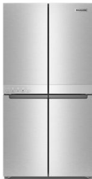
SUITE MATCH REFRIGERATOR KRQC506M