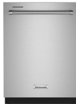
SUITE MATCH DISHWASHER KDTM404K