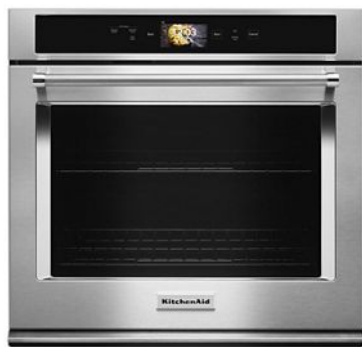
ALSO AVAILABLE / STEP UP KOSE900H

Be sure to tune into your customers' shopping priorities to bundle products across categories