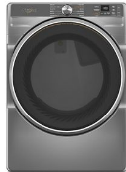
LAUNDRY / PAIR WITH (GAS) WGD6720R