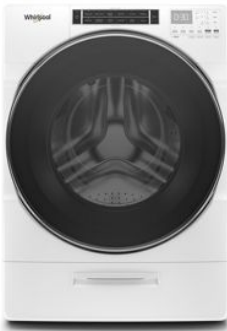
ALSO AVAILABLE / STEP UP WFW8620H

Be sure to tune into your customers' shopping priorities to bundle products across categories